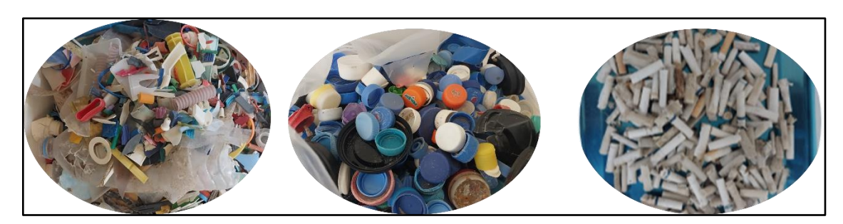
Figure 6: The most common litter categories

It was also found that the most common items are plastic pieces of sizes ranging between 2.5 and 50 cm (plastic caps and cigarette butts, reported especially in Saida) (Figure 6).