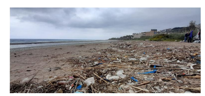
Figure 3: Litter found on Lebanese beaches

It was found that the number of litter items on the three beaches exceeds 10,000 items/100 meters, which is a very high number when compared to the number recorded by several studies on other beaches in other countries.