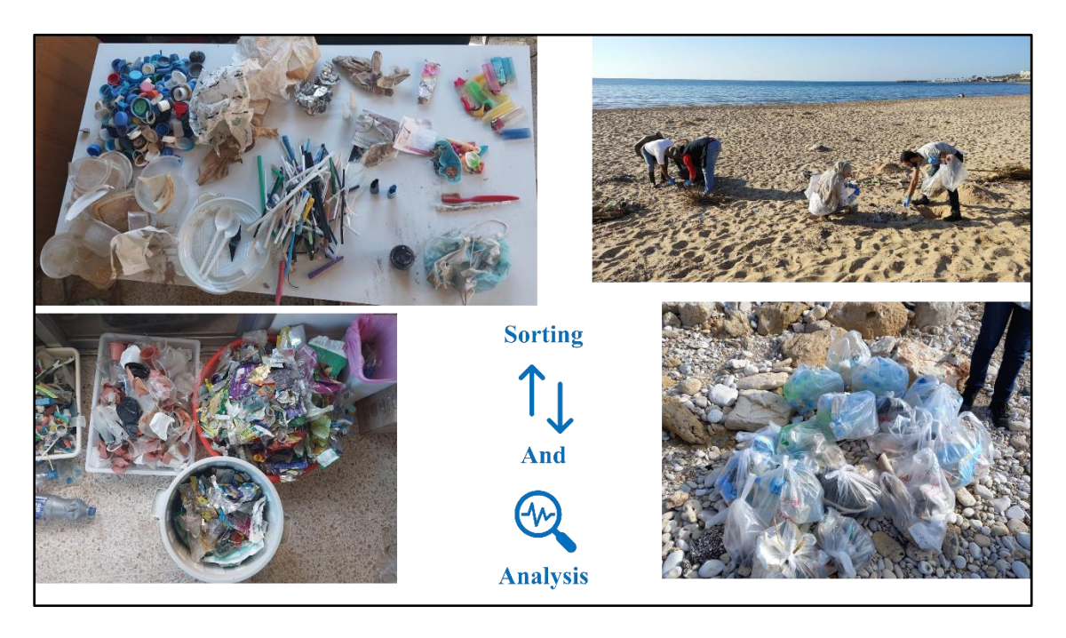
Figure 5: Beach litter field campaign and subsequent sorting and analysis

It was also found that the most common items are plastic pieces of sizes ranging between 2.5 and 50 cm (plastic caps and cigarette butts, reported especially in Saida) (Figure 6).