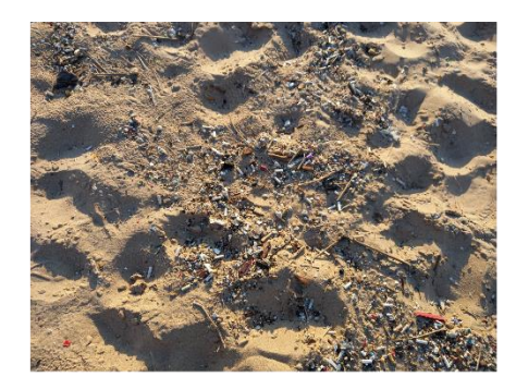
Litter on beaches